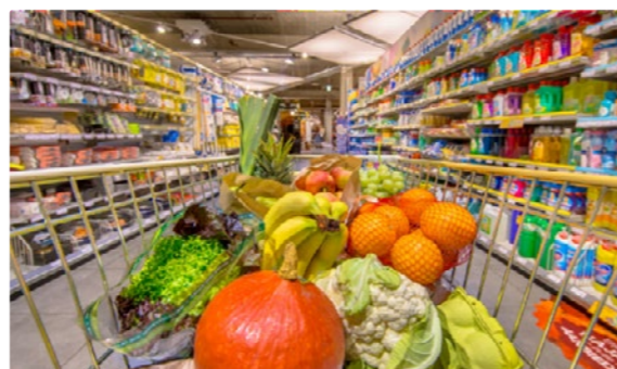
Vision After Cataract Surgery

Having your cataracts removed can be a major turning point, especially if you've had to deal with them for a long time. Over this time, you would have become accustomed to poor eyesight and found difficulty in doing tasks like driving or reading and